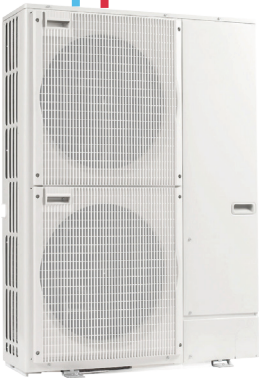
Outdoor DX Unit