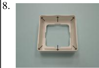
There are 6 cable entries on frame.