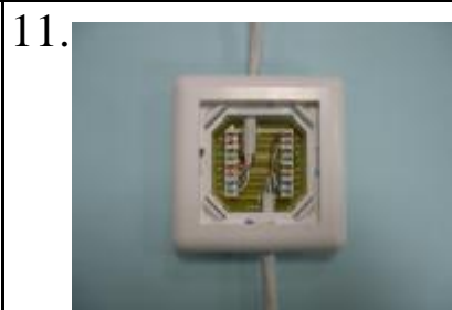
Put frame on base housing again.