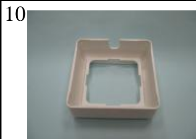
After tear off cable entry hole.