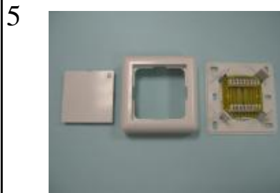
Separate frame from base housing.