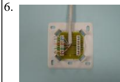
Follow the direction on the color coding to position T568B or T568A wiring, separate a little space on proper position and insert the 4 pair wires into the slot, then keep the twist as near IDC as possible.