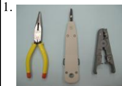
Stripper, Punch down, Tongs Tool.