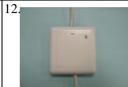
Push down central cover.