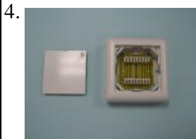
Surface mount wall box contain housing, module & central small plate.