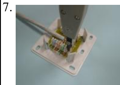
Use a punch down tool to complete the termination and cut off any access wire.