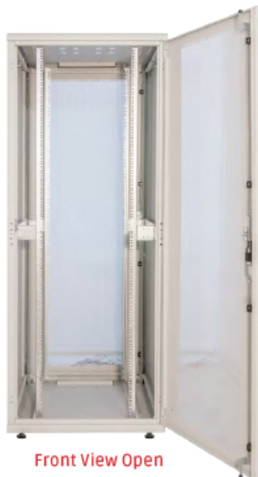
Front View Open