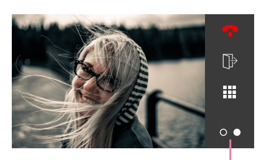
Press to change the menu

Press to open the communication channel.