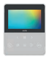
NEOS HANDS FREE